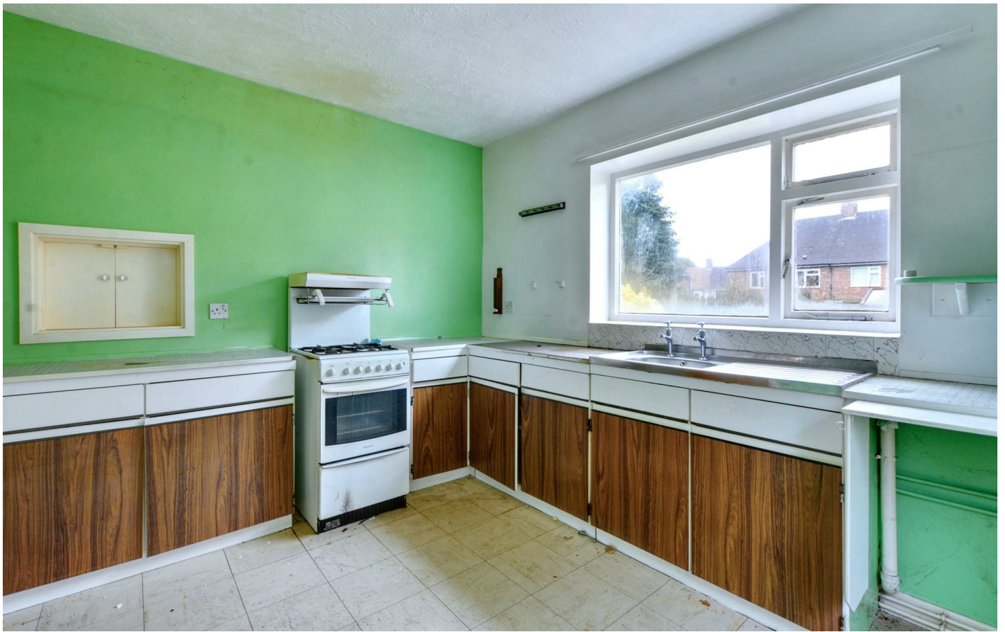
A Three-Bedroom Semi-Detached House.

Situated in this popular and convenient residential location, readily accessible for a variety of local shops and amenities including schools, transport links, Beeston Town Centre and the A52 and M1, this fantastic property is considered an ideal opportunity for a range of potential purchasers including first time buyers, young professionals, families and investors.